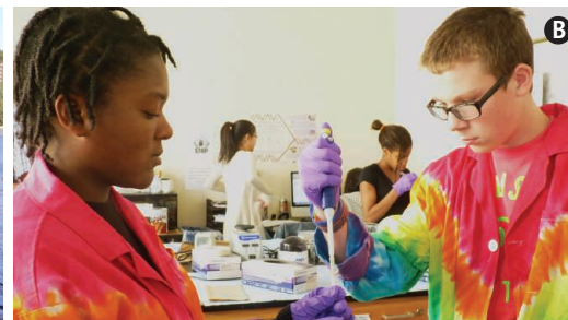
NYC students working with curriculum. (A) Students cataloging diversity and collecting samples from Inwood Hill Park in Northern Manhattan for unit 1 of the curriculum. (B) Students in the science research lab at their high school, extracting DNA in order to generate barcodes.

(1). We use DNA barcoding as the foundation for introducing students to modern biological research. Initially, we set out to develop a research course that serves as an alternative to more traditional laboratories, which often have known outcomes and lack student-generated investigations. Our goal was to provide an experience and skill set to students that would drive interest in the sciences and prepare them for the rigors of studying Science, Technology, Engineering, and Mathematics (STEM). Although we are in the age of genomics, too often the practical knowledge and necessary skills to succeed in science are not taught to students at the high school or even undergraduate level.